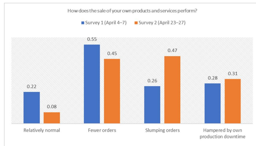
Figure 1. Impact of the COVID-19 crisis on orders in April. (Multiple answers possible, answers weighted by turnover, own illustration data from [26,27]).

In April, during the first wave of the COVID-19 pandemic, ZVEI conducted two surveys on the impact of the crisis on the electrical industry in Germany. 128 member companies participated in the survey at the beginning of April (4–7 April 2020). The participants comprised 24% (45 billion Euros) of the sector's turnover. 114 member companies participated in the second survey at the end of April (23–27 April 2020). The participants of this second survey comprised 41% (78 billion Euros) of the sector's turnover. Comparisons of selected results from both surveys are presented in Figures 1 and 2.