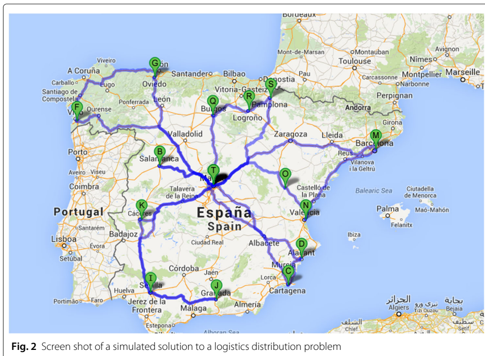
Fig. 2 Screen shot of a simulated solution to a logistics distribution problem

According to the different information sources used, that is, students' scores, students' opinions in the online forums about their learning process, and instructors' view of the learning process, it can be concluded that the use of simulation techniques and the visual representation of the solutions generated by the optimization algorithms were key factors to enrich and extend the existing theoretical background of the students so that they could link mathematical formulations and concepts to real-life applications in different fields. Although students in the course enjoy the possibility of learning new solving approaches that can effectively support managers during complex decision-making processes, they also acknowledge the methodological