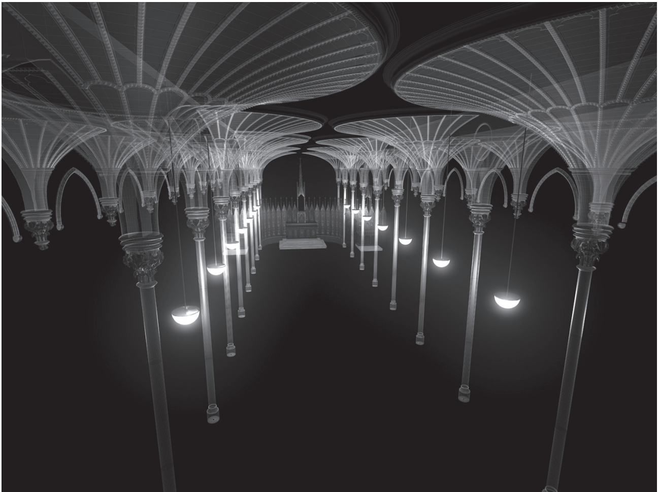
A detailed interior illustrates a fusion of datasets from laser scans, photogrammetry and 3-D modeling/texturing. Atmospheric lighting in the rendering environment adds a greater degree of realism.

In the protocol developed here the primary layer captures