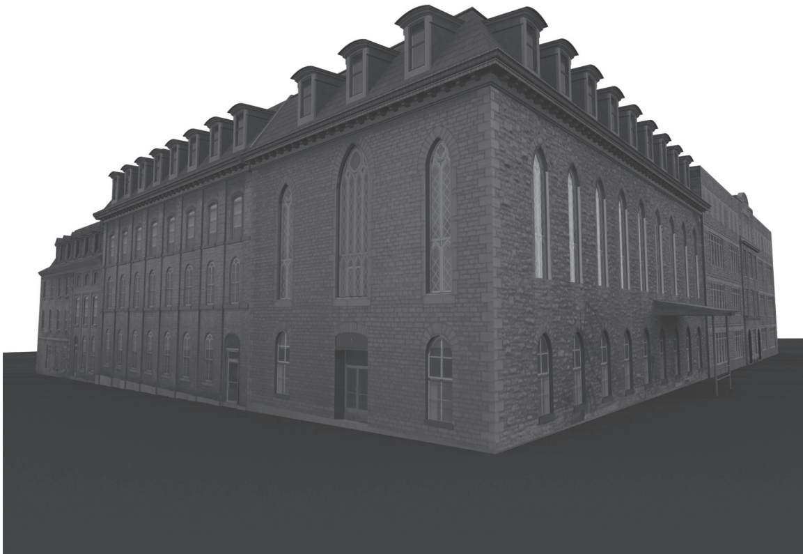
External building views were captured through a combination of photogrammetric and 3-D modeling techniques from archival photographs.

The Digital Architectural Reconstruction Program is a Canadian Heritage, New Media Research Network funded program that completed its first year of operation in March 2005. DARP is an initiative of the Carleton Immersive Media Studio (CIMS), an organized research unit within the Carleton University School of Architecture. The research agenda of the interdisciplinary group assumes an intertwining of project-based and applied research that, in the case of