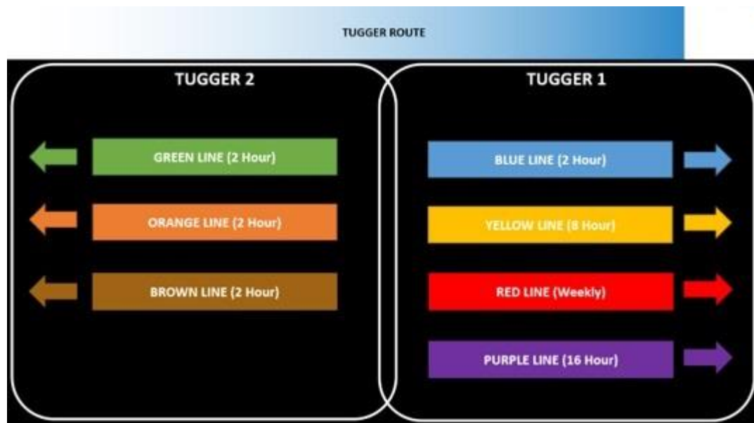
Figure 3. Typical Tugger Route Sign Recently Installed on Factory Floor

Figure 3 below. Consideration is being given to adapting the simulation model, with its animation, to the interactive training of material-handling workers to be hired in the future, analogous to the training in container terminals documented by (Cimino, Longo, Mirabelli 2010). Also, the study demonstrated how to increase production (and the variety thereof) by nearly 50% with only a 33% (from three to four) hilos.