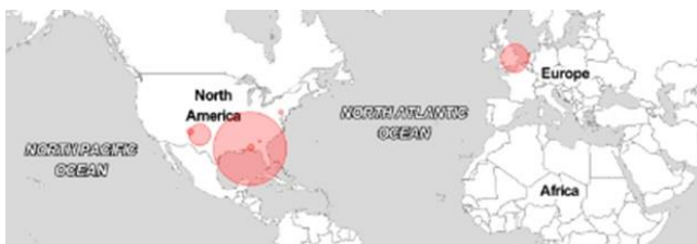
Figure 2. DoD Budget Geographic Effect

Drawing from the MongoDB, multiple views are provided. From the Budget Summary View the DM can observe his Total Obligational Authority (TOA), the proportional distribution of his varying appropriations categories, and his anticipated growth based on the previous year's budget. He may also compare another budget (e.g. prior year) to visualize the changing domain using adjacent views. The Budget Summary view also provides drill-down capability identifying contributors down to the PE level. Similarly, Program Budget Summary views support understanding of multiple resource category support to individual programs. By displaying multiple programs support summaries simultaneously, the DM can perform real-time tradeoffs between programs while keeping his overall portfolio below his TOA. Similarly, given a known amount for a budget adjustment or anticipated program, programs can be adjusted to free resources. A Geographic Effects view provides a visualization of resources drawn from a geographic location to indicate possible consequence associated with adjusting resources from a particular program or PE (Figure 2). In this example, the radius of the circle is defined by the budget assigned to that location.