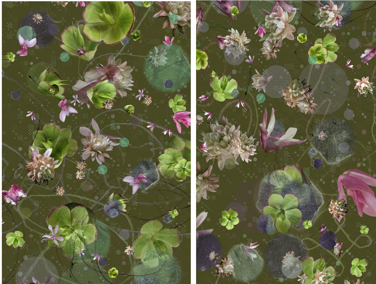
Figures 4a and 4b. Two sections of pattern produced by the Cloth of Gold version of the Repeatless code.

The printer would interpret the design simply as a sequence of images to be printed seamlessly, one after the other. Eventually either the fabric or the dyestuff would run out, but the design generation or streaming could just be paused at this point and restarted once the new substrate or colour was in place. The outcome is a design of any length that draws on the traditions of pattern, yet never repeats. From a research perspective, the value of the work is two new contributions to the field of printed textiles and surface pattern design: content-independent generative design and a method of both creating and printing repeatless design in any quantity. From an industrial standpoint, its output is desirable as a mass-customizable product that can use any imagery (that might include content uploaded by the customer). Furthermore, the removal of the need for repeat adds value as far richer, more