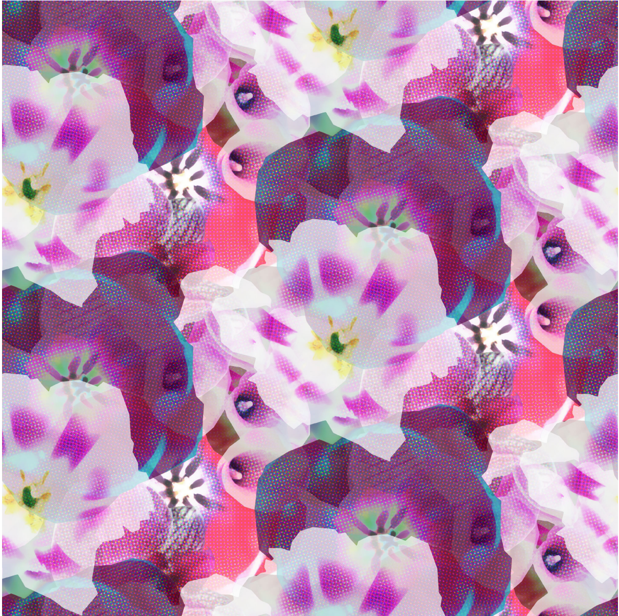
Figure 1. “aram1006” (Russell, 2005), a repeat design for digital printing.

However, this research proposes that digital printing can do something altogether different from the previous technologies. It could output an ever-changing design, shifting the paradigm that the print process is about doing the same thing over and over again.