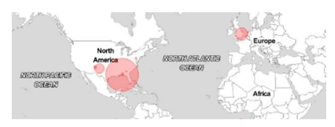
Figure 2. DoD Budget Geographic Effect

Drawing from the MongoDB, multiple views are provided. From the Budget Summary View the DM can observe his Total Obligational Authority (TOA), the proportional distribution of his varying appropriations categories, and his anticipated growth based on the previous year's budget. He may also compare another budget (e.g. prior year) to visualize the changing domain using adjacent views. The Budget Summary view also provides drill-down capability identifying contributors down to the PE level. Similarly, Program Budget Summary views support understanding of multiple resource category support to individual programs. By displaying multiple programs support summaries simultaneously, the DM can perform real-time tradeoffs between programs while keeping his overall portfolio below his TOA. Similarly, given a known amount for a budget adjustment or anticipated program, programs can be adjusted to free resources. A Geographic Effects view provides a visualization of resources drawn from a geographic location to indicate possible consequence associated with adjusting resources from a particular program or PE (Figure 2). In this example, the radius of the circle is defined by the budget assigned to that location.