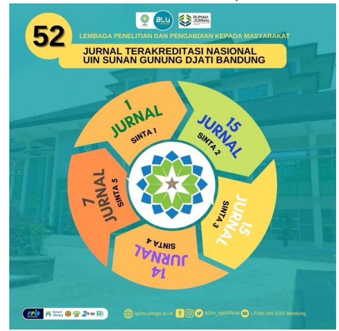
Figure 1. Achievement of SINTA accredited journal of UIN Bandung

(LP2M) increased by 64.52%, and books published increased by 45.16% during three academic years.<sup>19</sup>