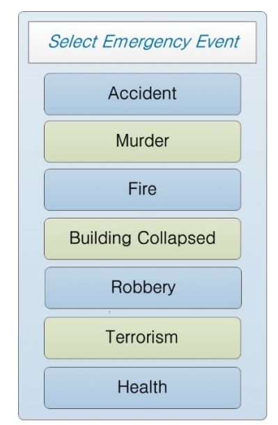
Figure 1. Basic interface of proposed E-HAMC.

Among the available services, none of them is capable enough through which appropriate emergency tackling department (e.g. fire-brigade) is directly contacted by the application, upon user's single action or click of a button, instead, the user or victim has to decide which departments have to be contacted and then find out their contact numbers. Our system not only does that, at the same time, a message is sent to the close family members (as many as user wants to) of the user. In our case, proposed E-HAMC maintains a list of those family members. With this, user does not need to find out which department to be communicated and search for contact numbers of family members at the time of emergency. User will only click on the type of event; rest of the things will be done by the application, in coordination with the Fog. The exact location of that even can be sent through global positioning system (GPS) or through base tranceiver station's (BTS) location, avoiding further hassle. Fog will be able to take the initial location coordiates and enrich it with more exact and refined location mapping, which also includes street-view feature and available paths identification. The basic interface currently provides seven different types of emergency notification options: accident, murder, fire, building collapsed, terrorism, robbery, and quick health fix. Figure 1 shows the basic interface.