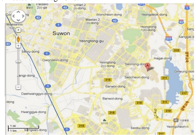
Figure 2. Location mapping of the contacting device

As mentioned earlier, the data may be uploaded in the cloud, which helps related departments for better planning and future betterment [8]. All concerned departments will be able to access all type of incidents' information over the cloud and analyze it. For instance, if some area experiences more accidents at nighttime due to bad light or sharp turns, then that issue can be tackled in future. Similarly, hospitals and ambulance service providers can see which locations are more suitable to have their resource point or emergency vehicles' located, for quick response and have reachability to the place of event, keeping in view the frequency and types of events that occur in a particular area. In case of emergency situation, instead of thinking about whom to contact and how to contact and then inform the family members as well one by one, the user only has to select the type of event occurred through a simple user-friendly menu. Upon doing that, the application sends message to the control center of appropriate emergency dealing department by sending a short message, including the place of that event, shown in figure 2, which can be taken from the BTS the cell phone is being connected or through GPS.